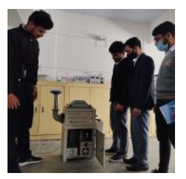
Respirable Dust Sampler