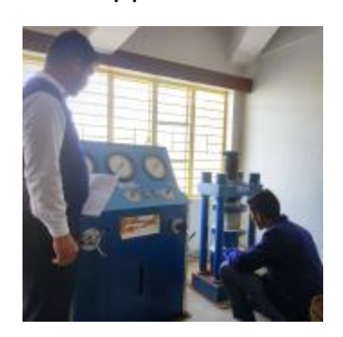
Compressive Strength Machine