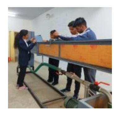
Open Channel Apparatus