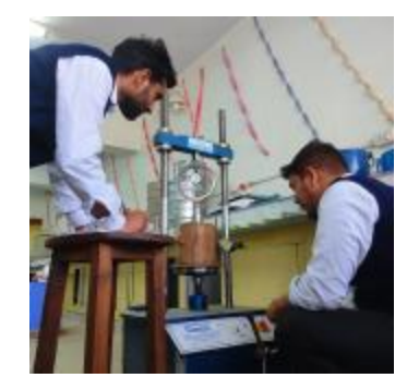
California Bearing Ratio Test