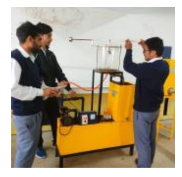
Impact Of Jet