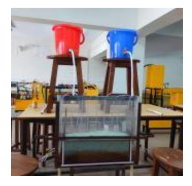
Salt Water Intrusion